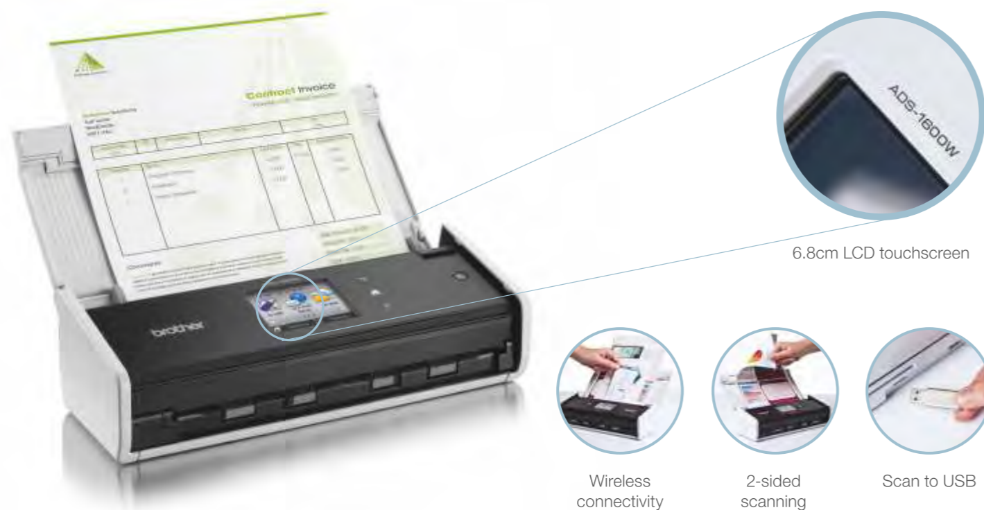
6.8cm LCD touchscreen

The ADS-1600W boasts a wide range of features designed to make your day more efficient and productive. When combined with the included powerful software suite, the ADS-1600W can easily scan, share and organise your documents for easy retrieval of important information.