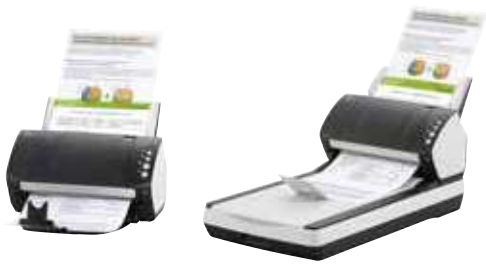
fi-7140 / fi-7240 – A4 Portrait at 300 dpi 40 ppm / 80 ipm Scan mixed batches through the 80 sheet ADF